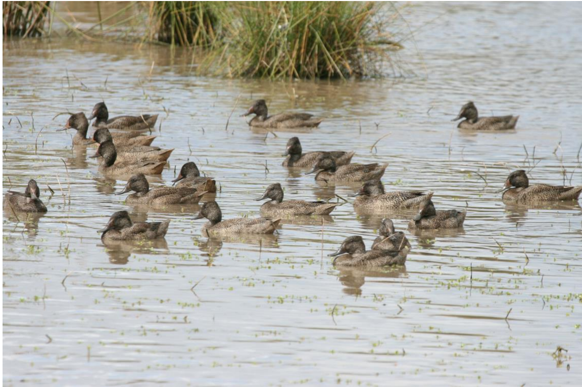
Freckled Ducks . They breed in the lower Murray Darling Basin, but come here in drought time. A classic case of a species that relies on the Gippsland Lakes for its survival as a species and the importance of the Lakes system as a drought refuge.