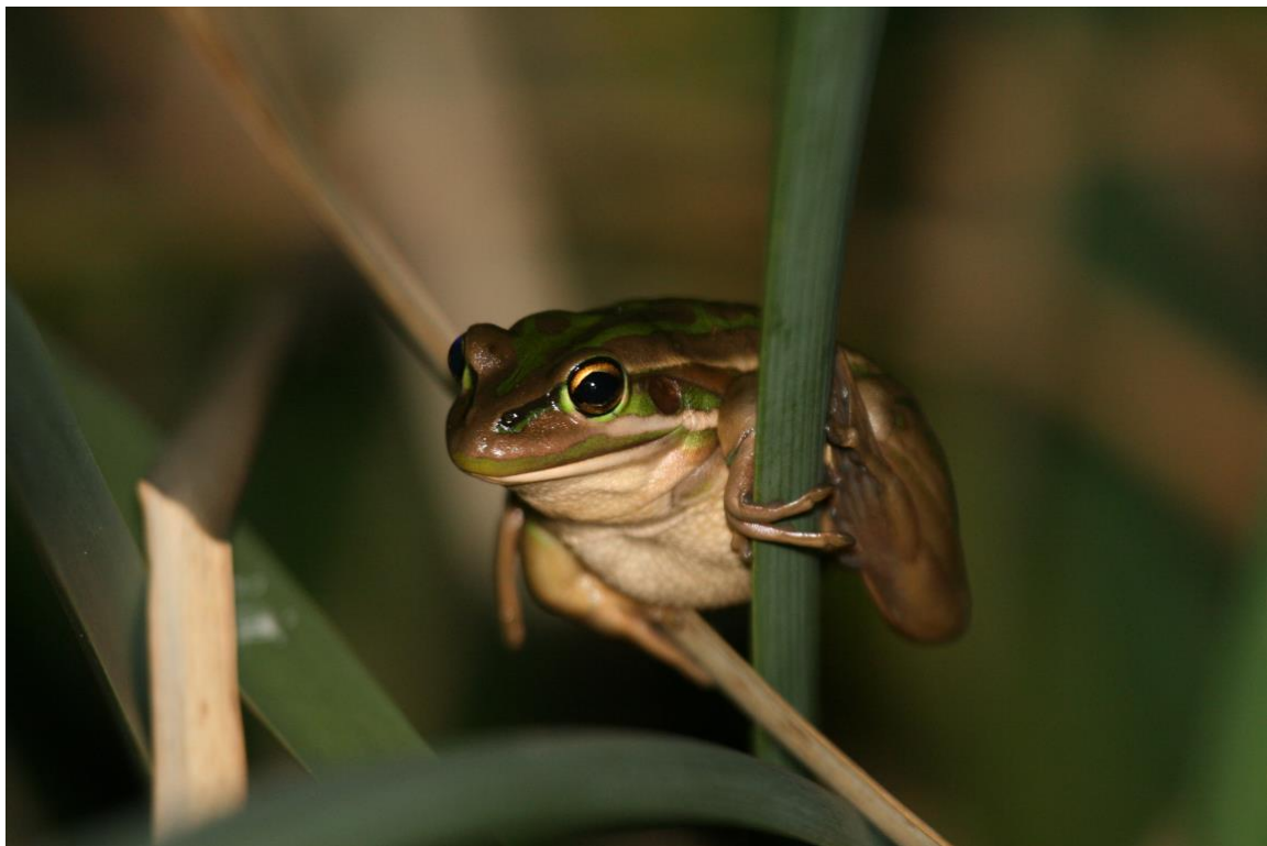
Green and Gold bell frogs once very common in the fringing wetlands of the Gippsland Lakes now are only found in small areas near Clydebank Morass (the Avon River entrance into Lake Wellington.)