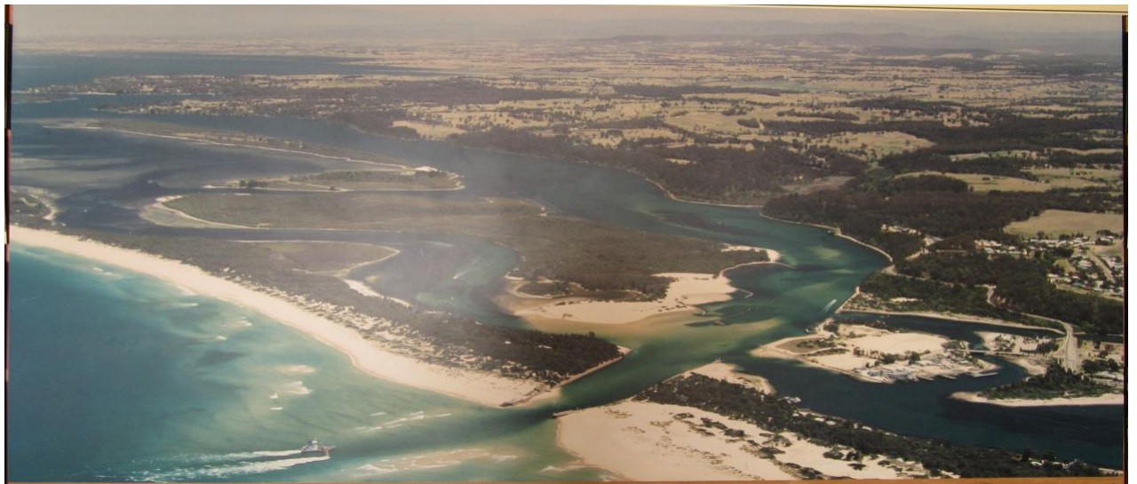
The Entrance before August 2008 deepening. It shows the numerous sand bars which slowed the ingress of salt water.

A condition of Gippsland Ports' permit for dredging the Entrance is that the Ports authority must protect the nesting sites of the Little Tern, the Fairy Tern and the Hooded Plover on adjacent islands. The increased tidal speed and scour has washed away these protected birds' nesting sand, putting the Ports authority in breach of their permit.