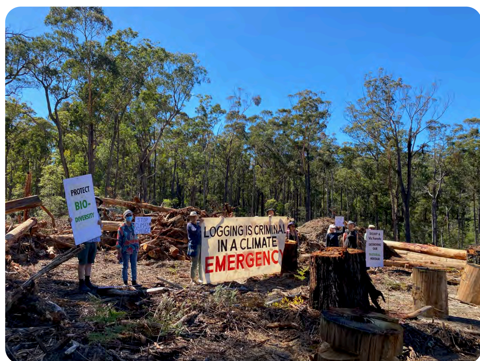
East Gippsland locals protest logging in 'Lior', Colquhoun State Forest

According to the Environment Department's biodiversity response and recovery report for the 2019/2020 bushfires 35% of Yellow-bellied Gliders modelled habitat is within the fire extent and 18% within high severity burn areas. The species is set to be listed as Endangered under Federal environment law.