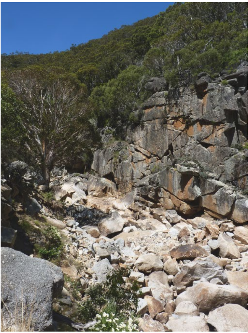
Gungarlin River in upper Snowy catchment

There are still rivers and creeks in the upper Snowy catchment in Kosciusko National Park that have been dry for 50 years (see photo above: Gungarlin River in upper Snowy catchment ). The Eucumbene River, once known as the east branch of the Snowy, was also not included in the Snowy environmental flows agreements.