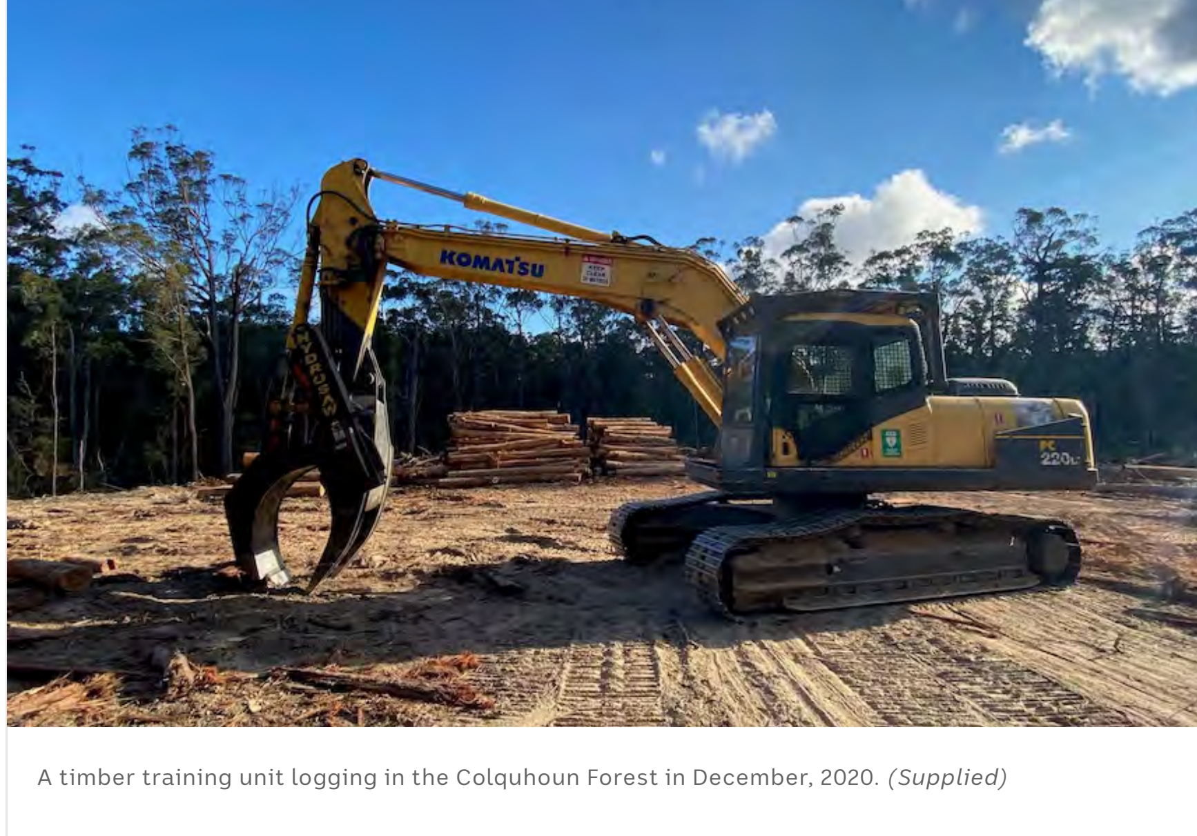
A timber training unit logging in the Colquhoun Forest in December, 2020.

Posted Sat 12 Dec 2020 at 10:00am, updated Sat 12 Dec 2020 at 10:06am