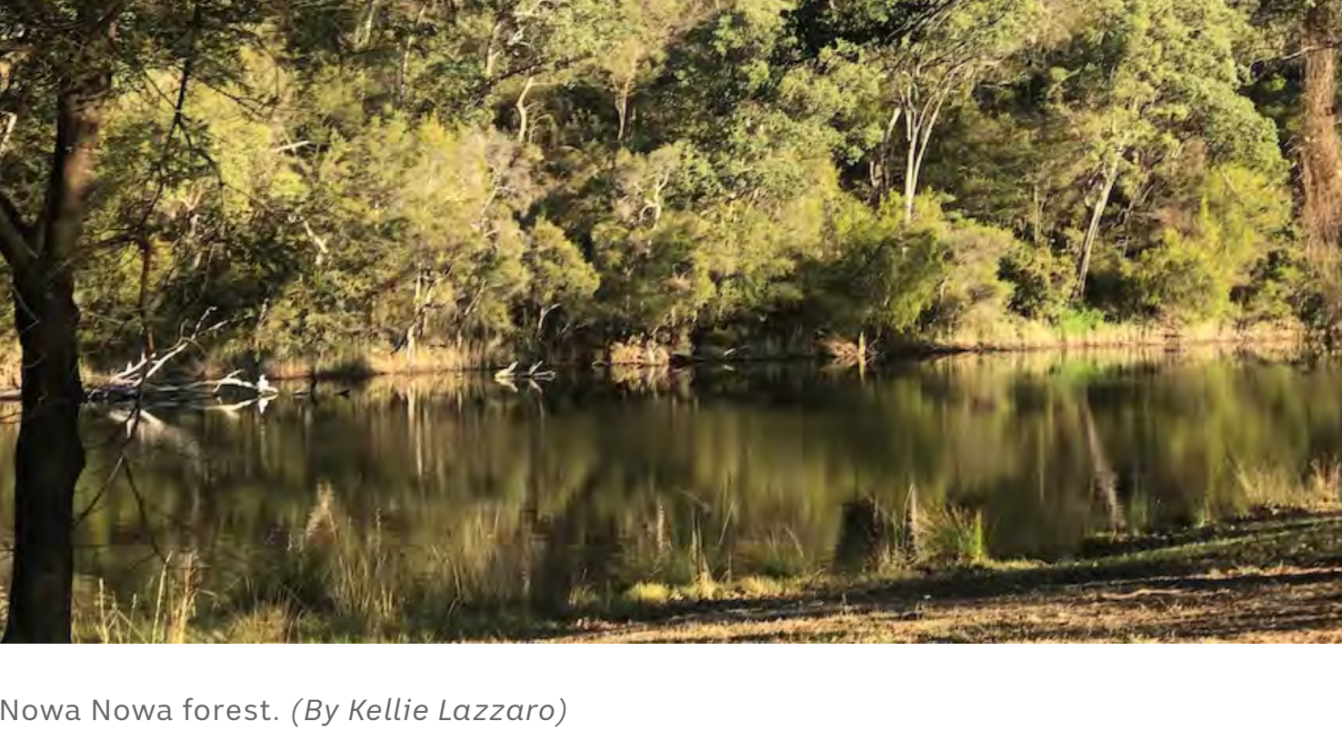
Nowa Nowa forest.

The coupe at Nowa Nowa is the second unburnt coupe allocated for TAFE training this year and the latest in a handful of unburnt coupes logged in recent months.