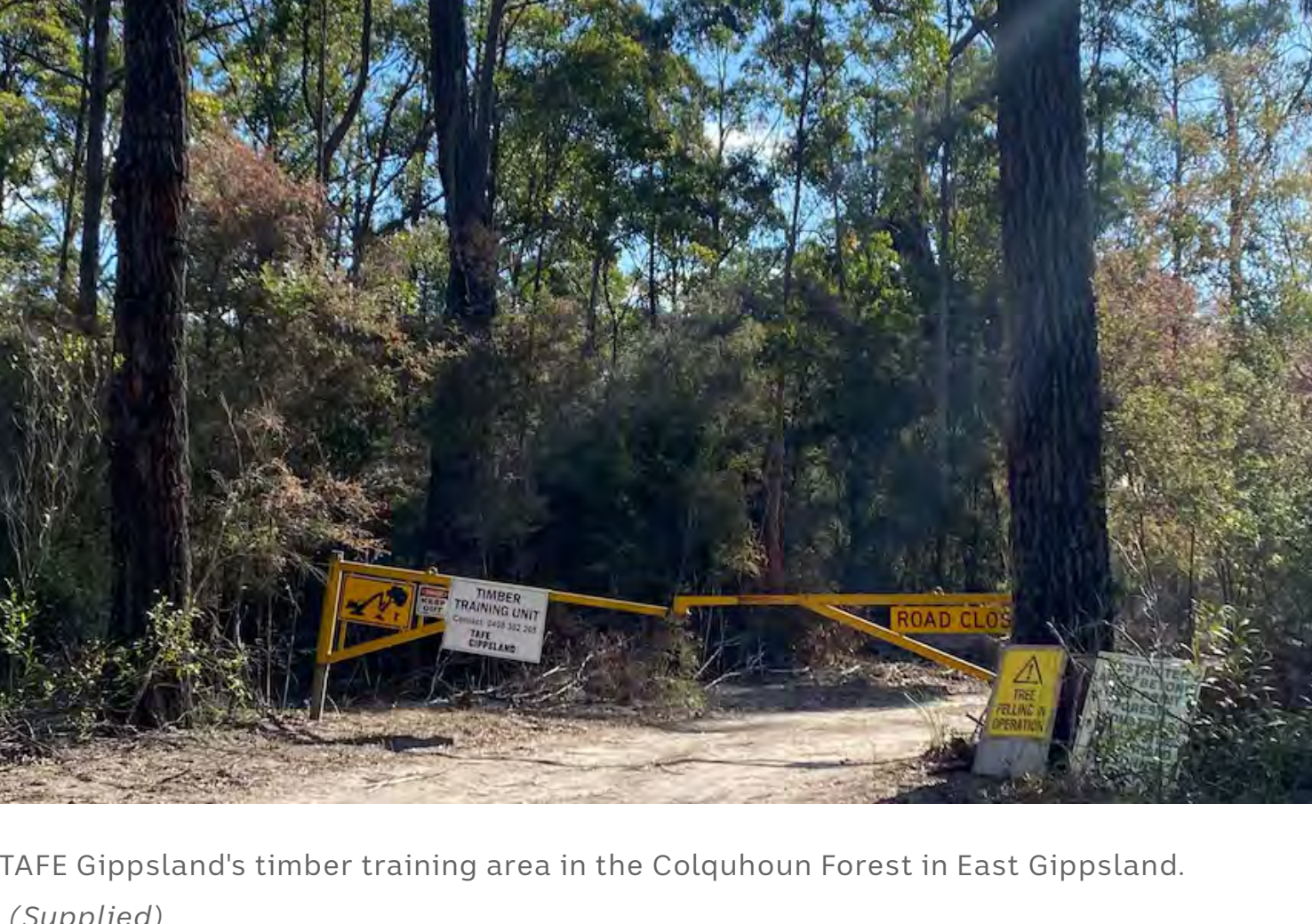
TAFE Gippsland's timber training area in the Colquhoun Forest in East Gippsland.

"To place untrained people in a burnt coupe would place them in a very dangerous situation."