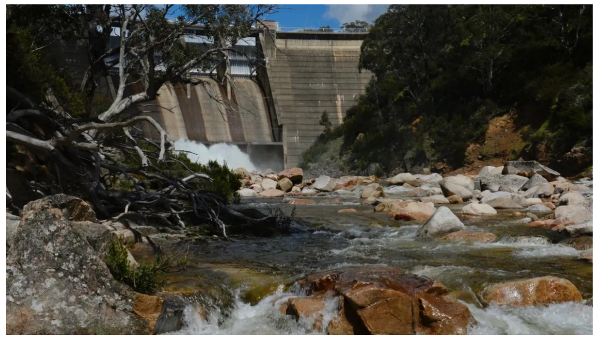
The Snowy River just downstream from the Island Bend Dam.

In September 2014, then water minister Kevin Humphries <u>trumpeted the</u> <u>passage of a law</u> replacing the Snowy Scientific Committee with a broader advisory panel, saying it would "ensure a balance between technical and water management expertise, scientific specialists and government, Indigenous and community representation".