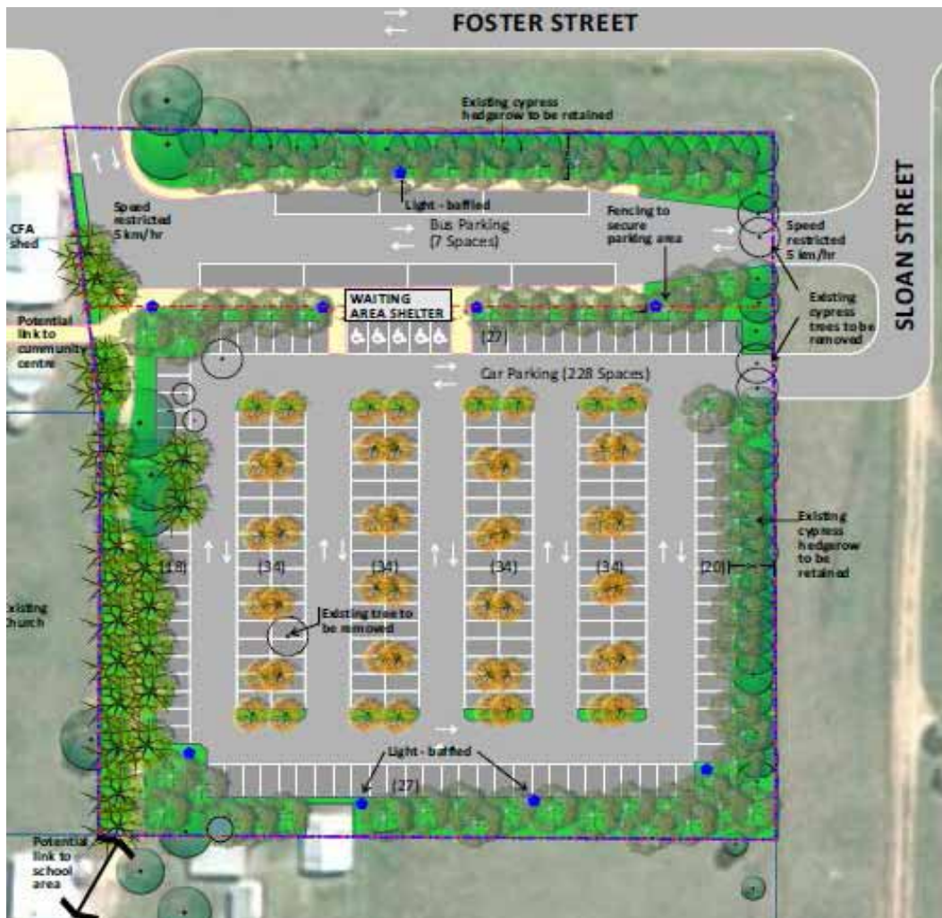
Figure 4 Indicative car park layout

To maximise safety and minimise traffic on roads, it is proposed to operate a ‘park and ride’ shuttle bus service from a proposed car park at Foster Street, Benambra (the car park) to the accommodation village and the mine. The use of private vehicles between Benambra and the village/mine will only be permitted for some management staff and contractors. The proposed car park of approximately 200 car spaces is accessed from Sloan Street and bus parking spaces are accessed via a one way crossover from Sloan Street and exit to Foster Street. Perimeter pedestrian paths link the car park to the existing facilities and waiting area shelter is proposed adjacent to the bus parking area (see Figure 4).