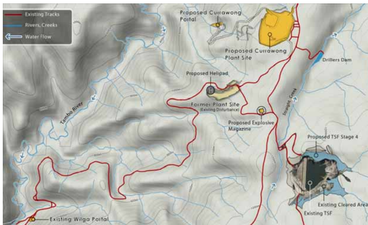
Figure 1 Proposed site layout

The Project will require a range of on and offsite ancillary infrastructure, including expansion of the existing Lake St Barbara Tailings Storage Facility (TSF), a processing plant, access roads, a bore field, water pipelines, electricity supply infrastructure, upgrades to the proposed transport route (along the Great Alpine Road to Bairnsdale), a worker accommodation village capable of housing around 180 people, and a car park in Benambra (see Figure 1). The precise delineation of some of the out-of-tenement infrastructure, in particular the water supply pipeline from the Benambra bore field, is yet to be determined.