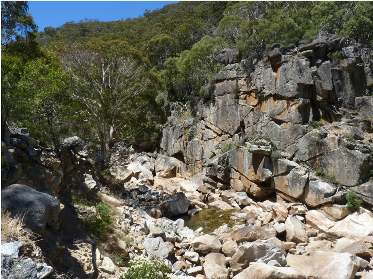
Gungarlin River, note same rockface, 18 Jan 2018