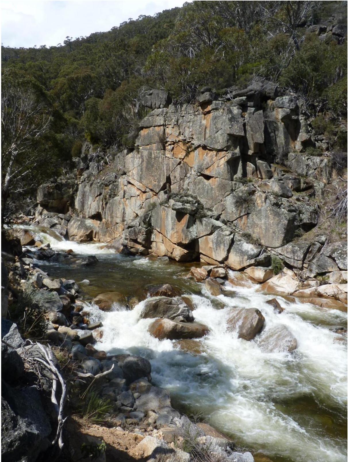
Gungarlin River, 5 Oct 2017